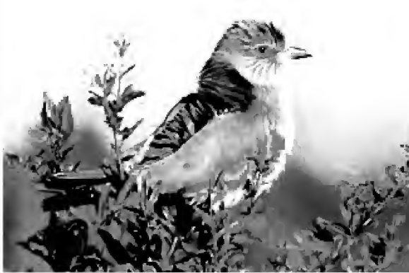
Indian Roller Coracias benghalensis

A star attraction of Hingolgadh, they are summer visitors here; Hingolgadh is one of the best places to photograph them as they are so fearless that one can capture them even on a mobile phone camera.